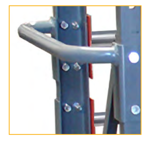
Push Handles for Steering